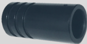
3W LED LIGHT SOURCE