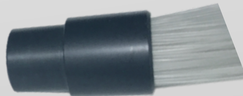
COMMON END FIBER OPTICS BUNDLE