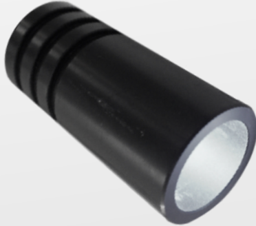
3W LED LIGHT SOURCE